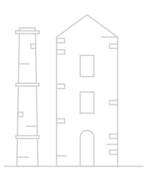
Moonta Mines National Heritage Area is amongst the most significant in Australia, illustrating the early mining mostly by Cornish immigrants.