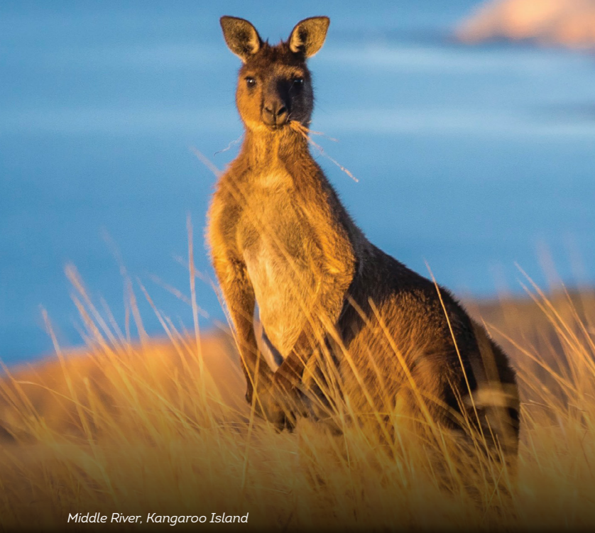
Middle River, Kangaroo Island