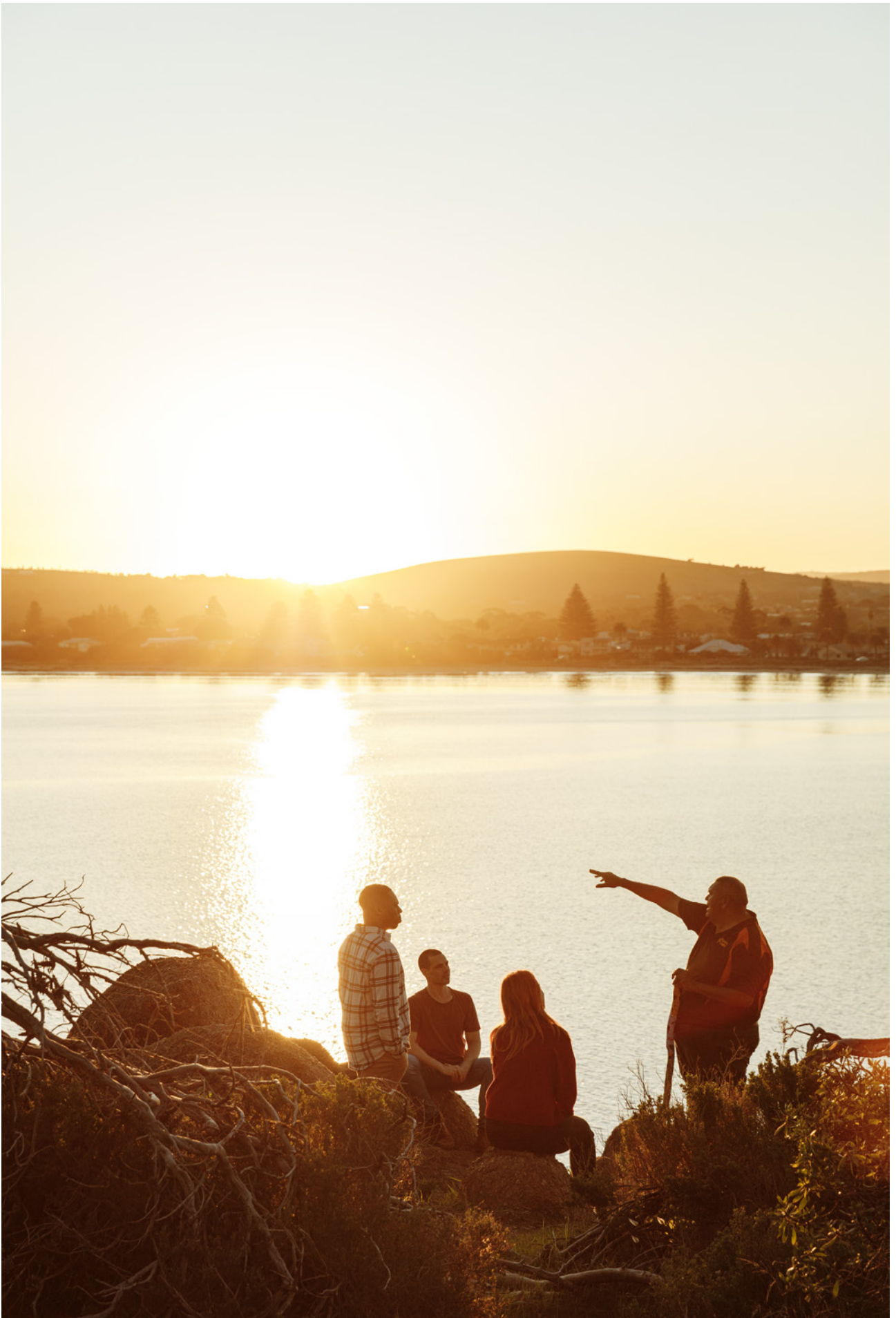
Above Kool Tours, Fleurieu Peninsula